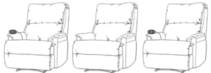
Hazleburst Power Recliner