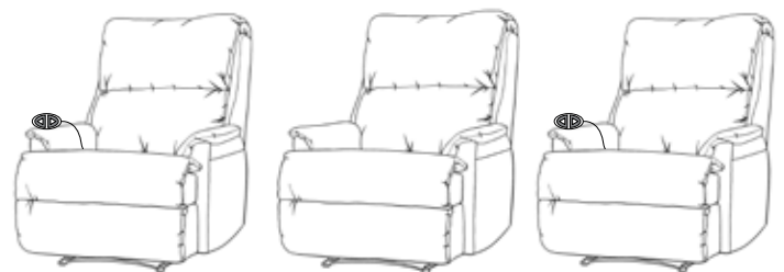
Hazleburst Power Recliner