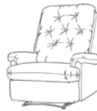
Hattiesburg Rocker Recliner