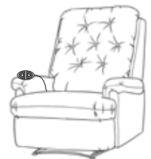
Hattiesburg Power-Lift Recliner