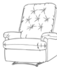
Hattiesburg Rocker Recliner