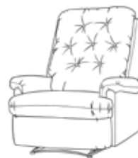
Hattiesburg Rocker Recliner