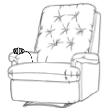
Hattiesburg Power-Lift Recliner