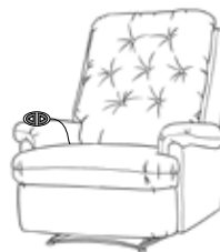
Hattiesburg Power Recliner