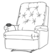
Hattiesburg Power-Lift Recliner