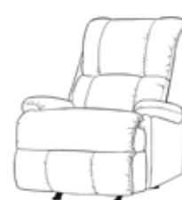
Baxley Rocker Recliner