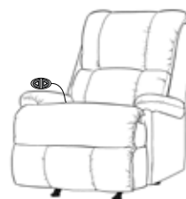
Baxley Power-Lift Recliner