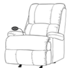
Baxley Power Recliner