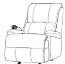
Baxley Power Recliner