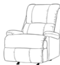
Baxley Rocker Recliner