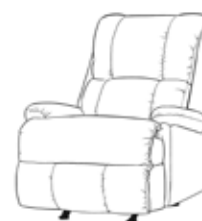
Baxley Manual Recliner