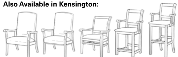
Kensington Occasional Chair Kensington Stationary Rocker Kensington Bariatric Dining Chair Kensington Counter-Height Stool Kensington Barstool