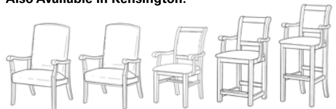
Kensington Occasional Chair