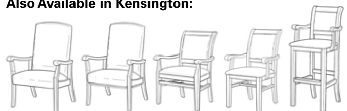
Kensington Occasional Chair Kensington Stationary Rocker Kensington Bariatric Dining Chair Kensington Dining Chair Kensington Barstool