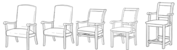
Kensington Occasional Chair Kensington Stationary Rocker Kensington Bariatric Dining Chair Kensington Dining Chair Kensington Counter-Height Stool