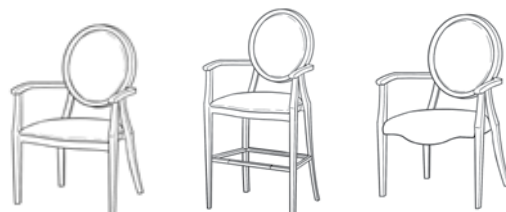
Gainesville Dining Chair