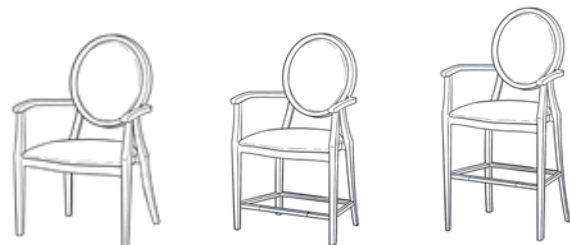
Gainesville Dining Chair