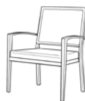
Galveston Bariatric Dining Chair