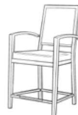
Galveston Counter-Height Stool