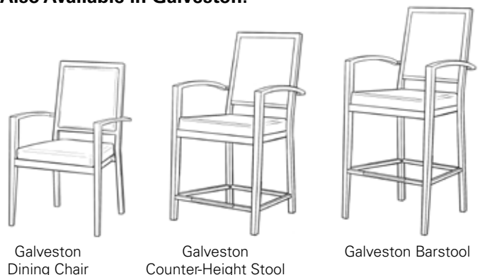
Galveston Dining Chair