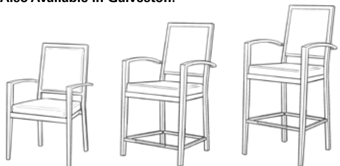
Galveston Dining Chair