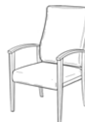
Huntsville Occasional Chair