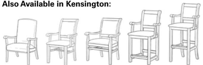
Kensington Stationary Rocker Kensington Dining Chair Kensington Bariatric Dining Chair Kensington Counter-Height Stool Kensington Barstool