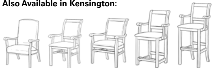
Kensington Stationary Rocker Kensington Dining Chair Kensington Bariatric Dining Chair Kensington Counter-Height Stool Kensington Barstool