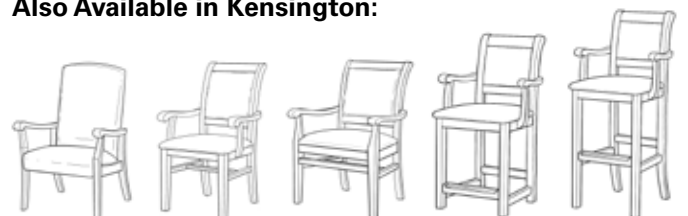
Kensington Stationary Rocker