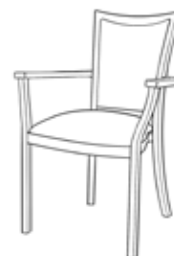
Huntsville Dining Chair