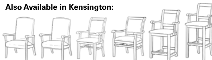
Kensington Occasional Chair Kensington Stationary Rocker Kensington Dining Chair Kensington Bariatric Dining Chair Kensington Counter-Height Stool Kensington Barstool