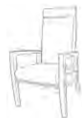
Galveston Stationary Rocker