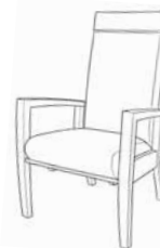
Galveston Stationary Rocker