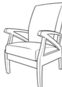
Silverthorne Stationary Rocker