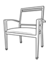
Denio Bariatric Dining Chair