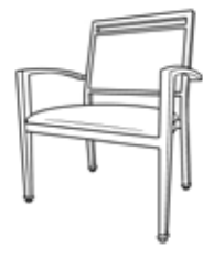
Denio Bariatric Dining Chair