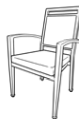
Denio Dining Chair