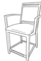
Denio Bariatric Counter-Height Stool