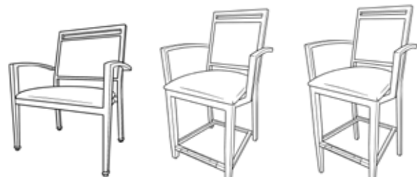
Denio Bariatric Dining Chair