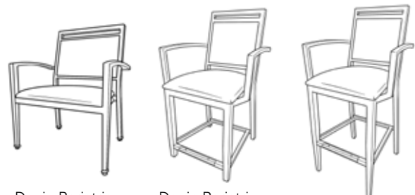
Denio Bariatric Dining Chair