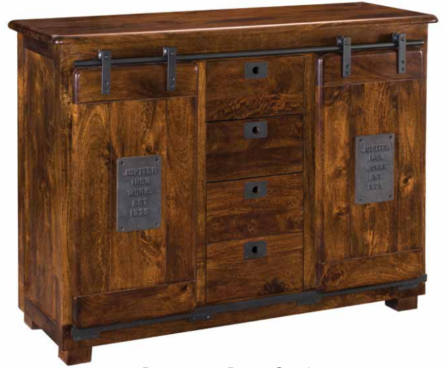
4-Drawer, 2-Door Credenza