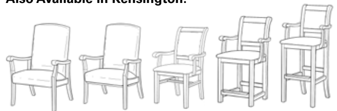
Kensington Occasional Chair