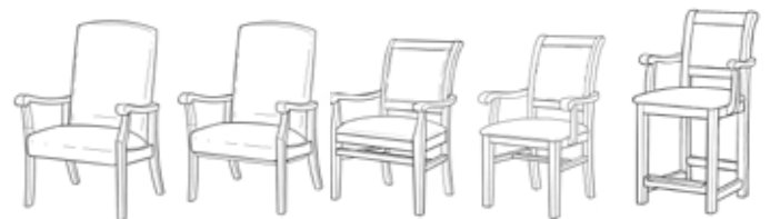
Kensington Occasional Chair Kensington Stationary Rocker Kensington Bariatric Dining Chair Kensington Dining Chair Kensington Counter-Height Stool