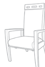
Scottsdale Occasional Chair