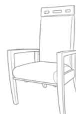
Scottsdale Stationary Rocker