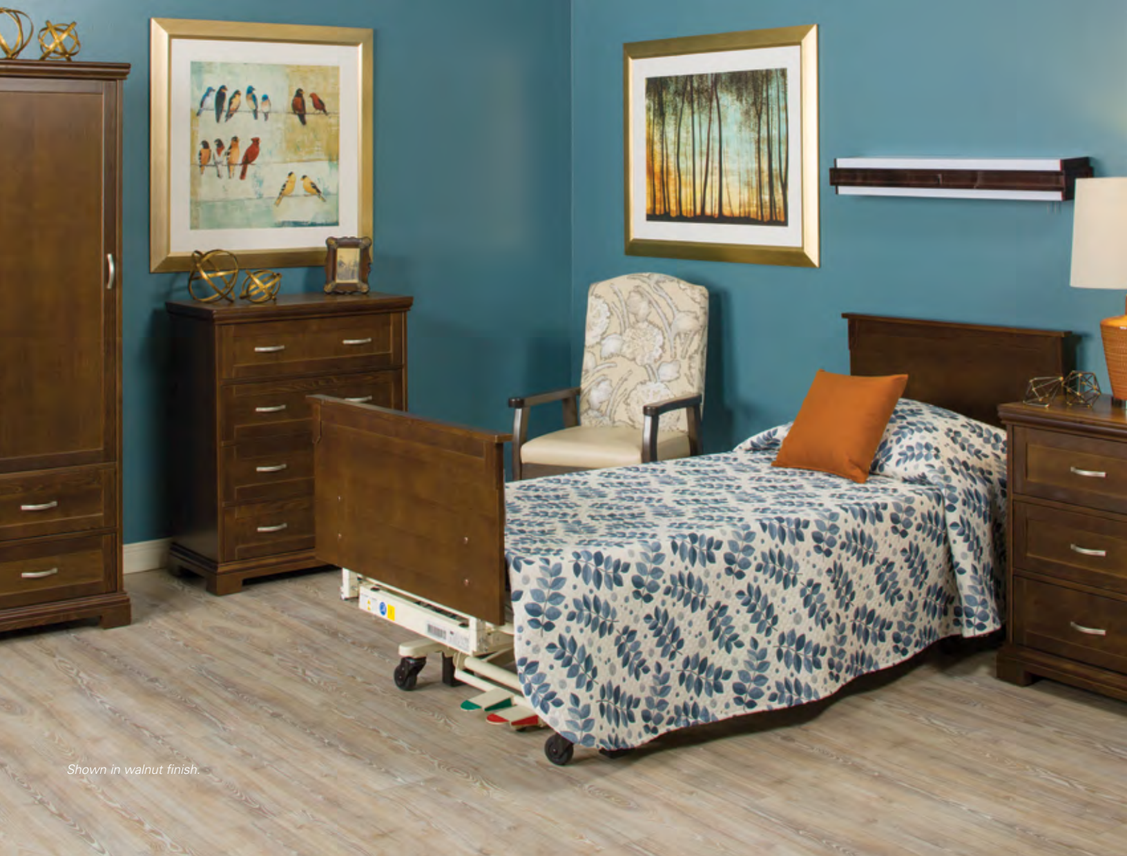
Shown in walnut finish.