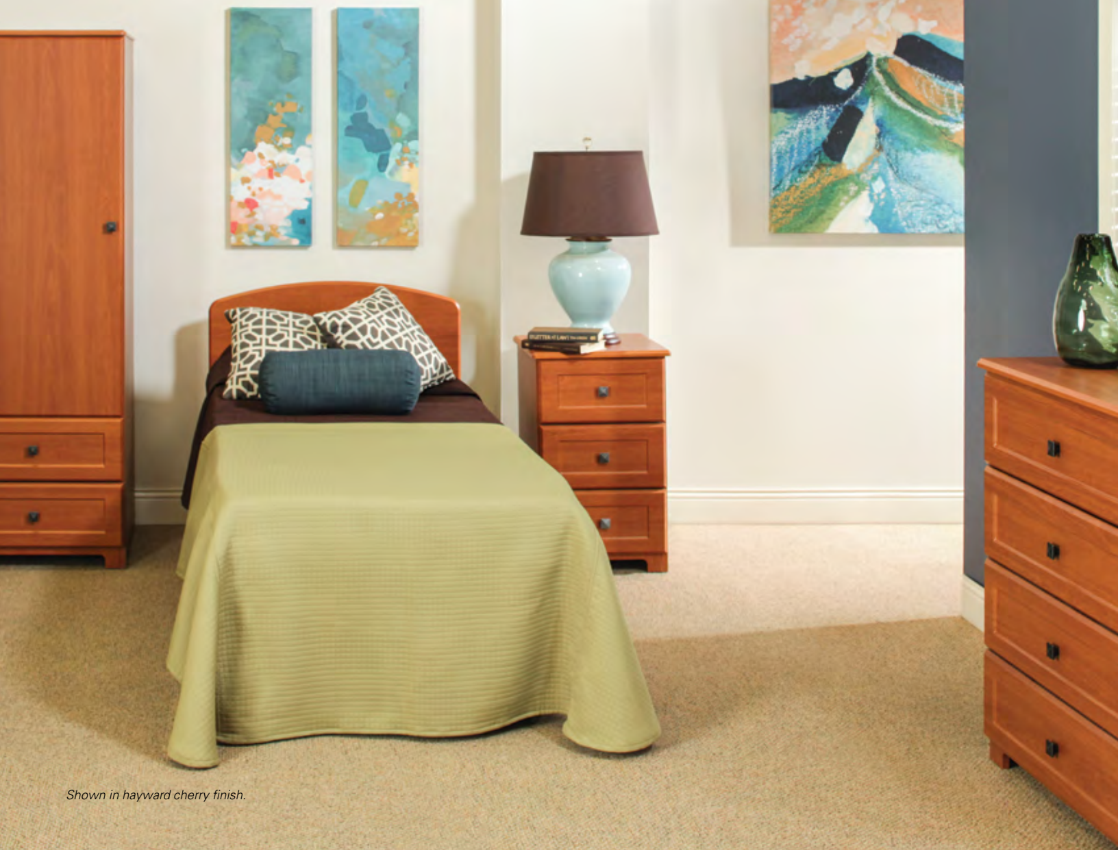
Shown in hayward cherry finish.