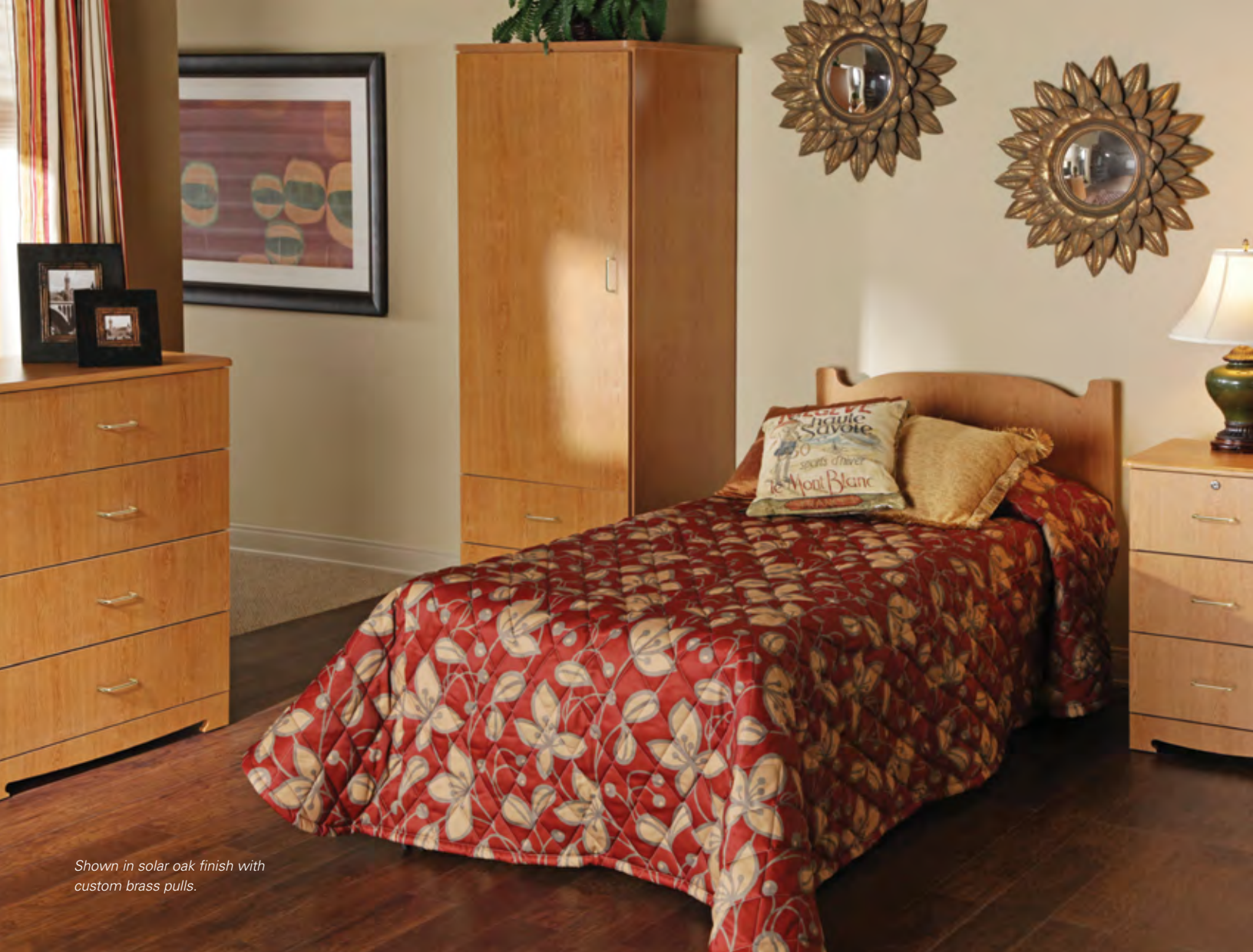
Shown in solar oak finish with custom brass pulls.