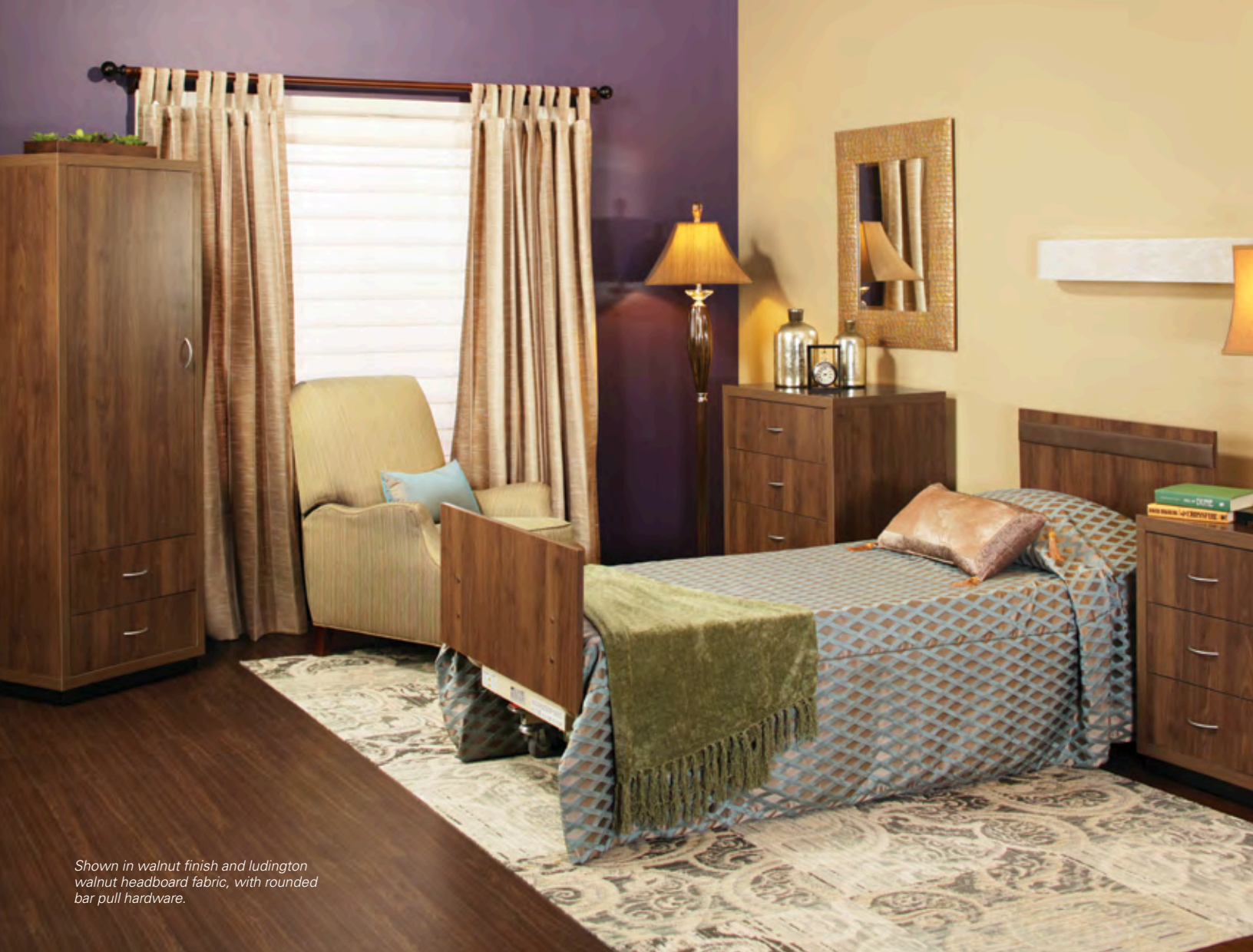
Shown in walnut finish and ludington walnut headboard fabric, with rounded bar pull hardware.