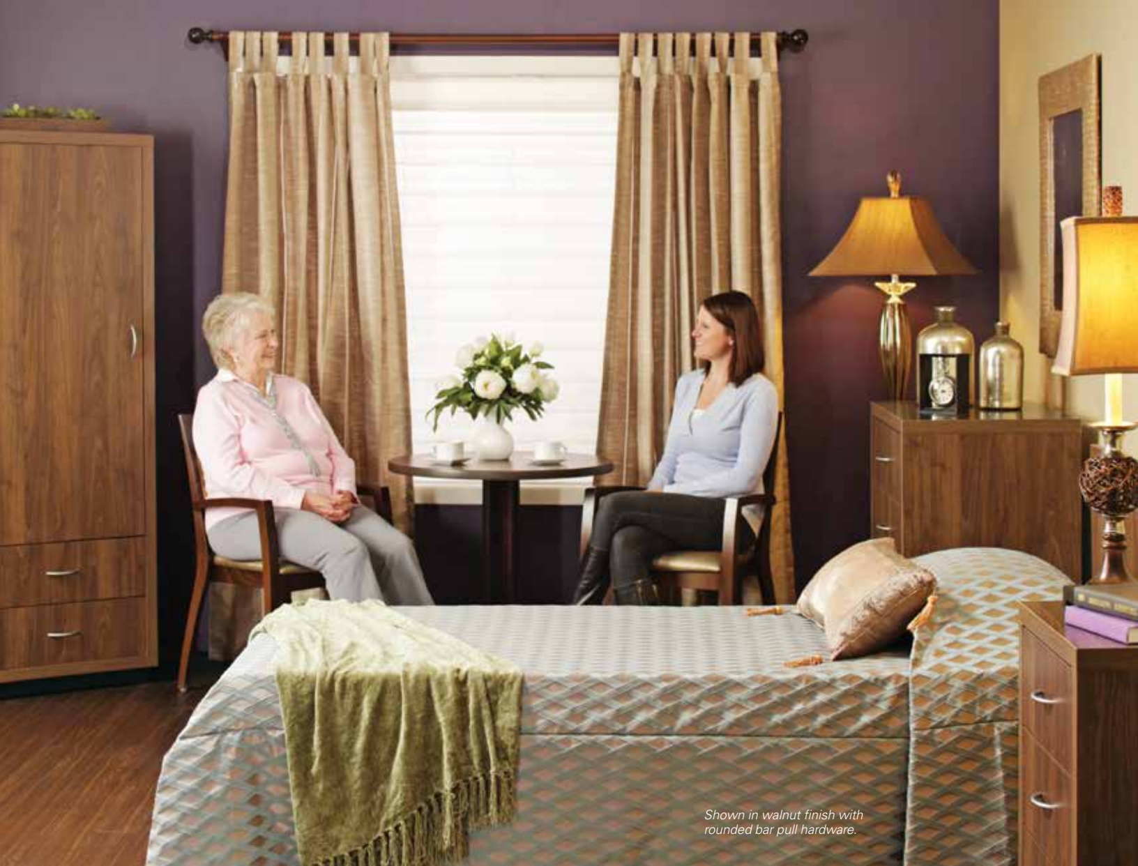
Shown in walnut finish with rounded bar pull hardware.