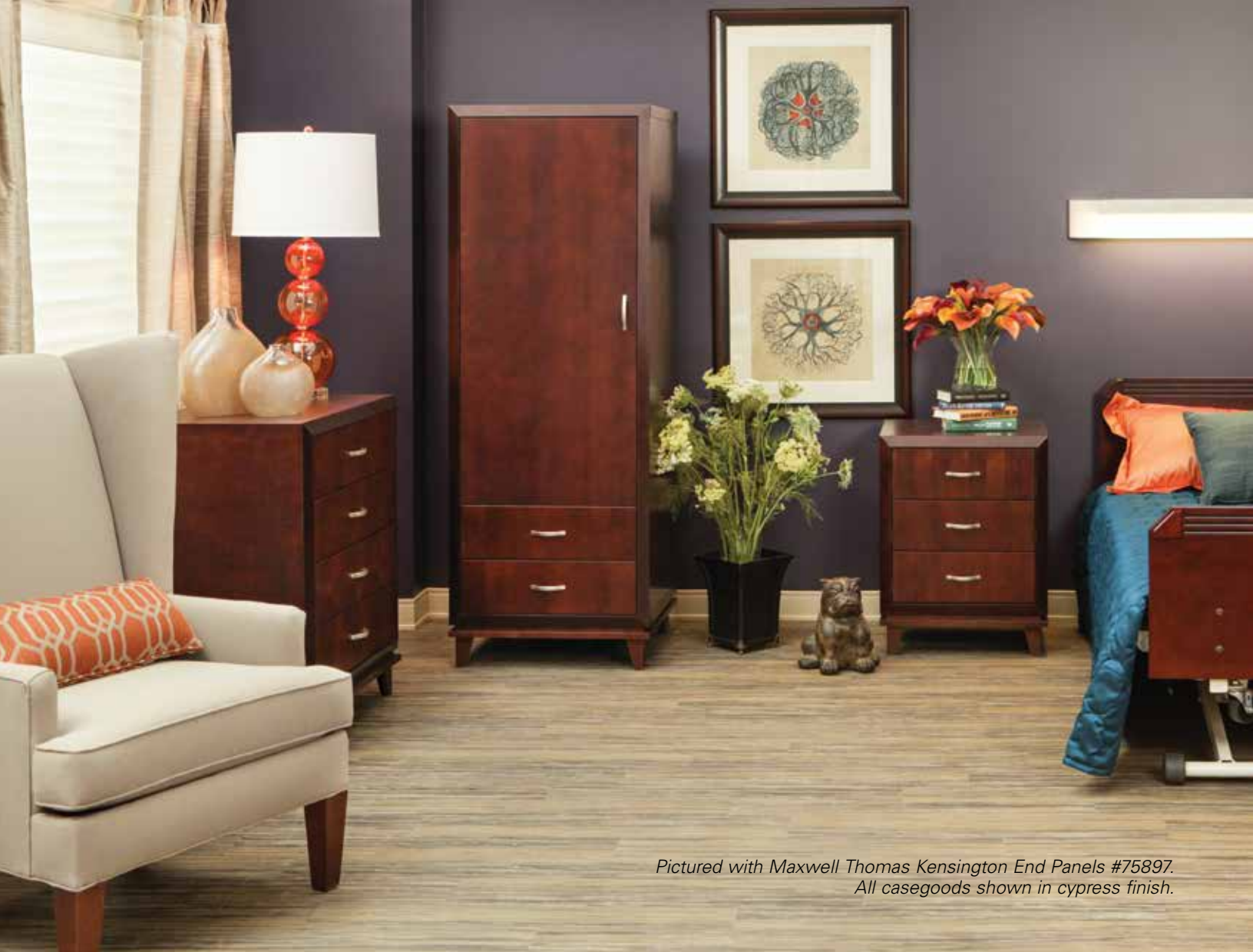
Pictured with Maxwell Thomas Kensington End Panels #75897. All casegoods shown in cypress finish.