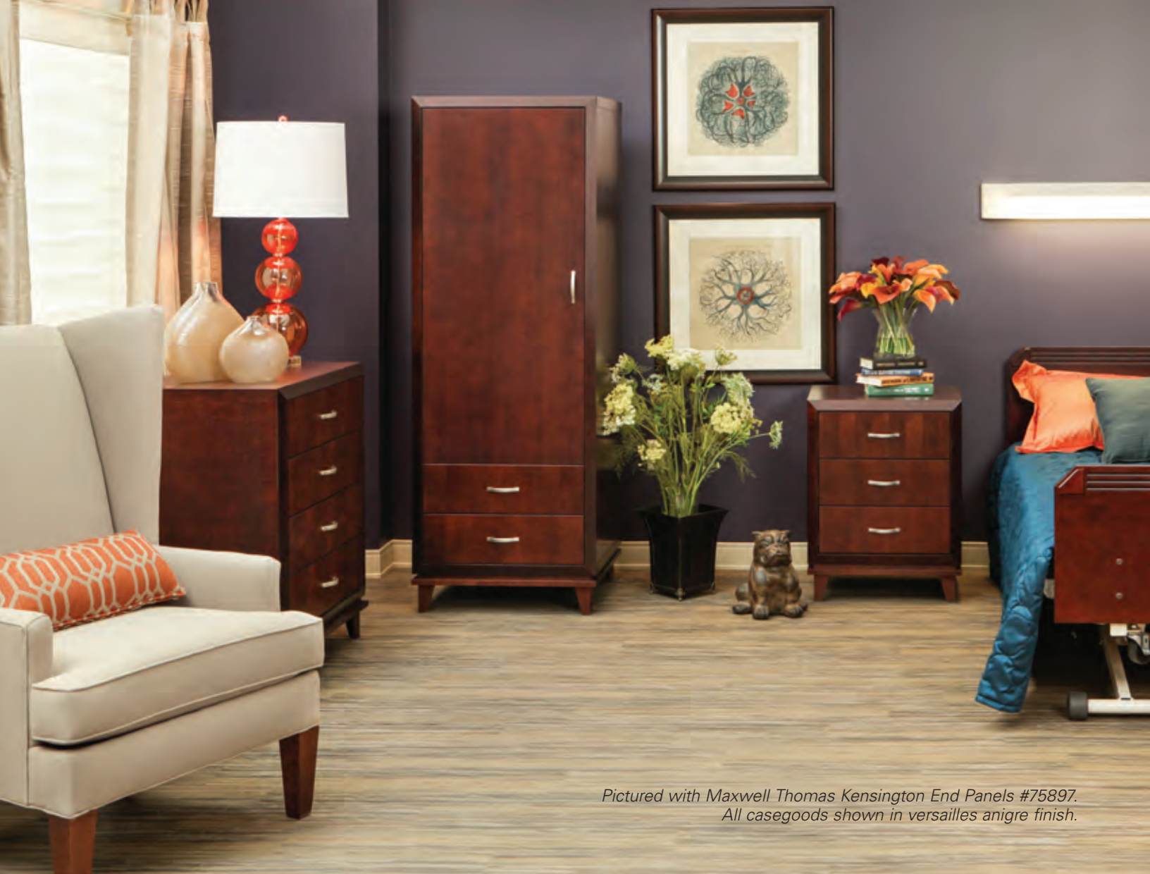
Pictured with Maxwell Thomas Kensington End Panels #75897. All casegoods shown in versailles anigre finish.